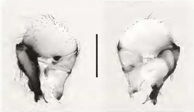
Figs 4-5: Crossopriza lyoni (Blackwall, 1867) (SMNS 1205); 4. Pedipalpus retrolateral; 5. Pedipalpus prolateral. Scale line = 1 mm

their ability to survive long transports even in shipping containers (Kobelt & Nentwig 2008). Thus, it seems possible that some juveniles or even adults were imported together with bamboo and could establish themselves in the permanently heated and regularly moistened salesroom and other heated rooms of the building. Bamboo is also used for decoration in terraria at the second location. Interestingly, there is another, more conspicuous connection between both locations. Some years ago, both received feeder insects from the same breeder (Meining pers. comm.). If C. lyoni could establish itself in a small breeding room of a zoological garden or the salesroom of a reptile supply shop, it seems very possible that the species builds larger populations in industrial breeding stations, from which it could easily spread to new locations with deliveries of feeder insects. However, populations of this species seem to be extremely resilient, since recovery after clean up only takes a few months. This is in accordance with Strickman et al. (1997), who described a development time of only 80 days for spiderlings from leaving the mother until creating their first egg sac, when fed ad libitum. Although the data represent laboratory results, the ability of the species to mature in less than three months seems to enable the population to compensate for heavy losses in a short time.